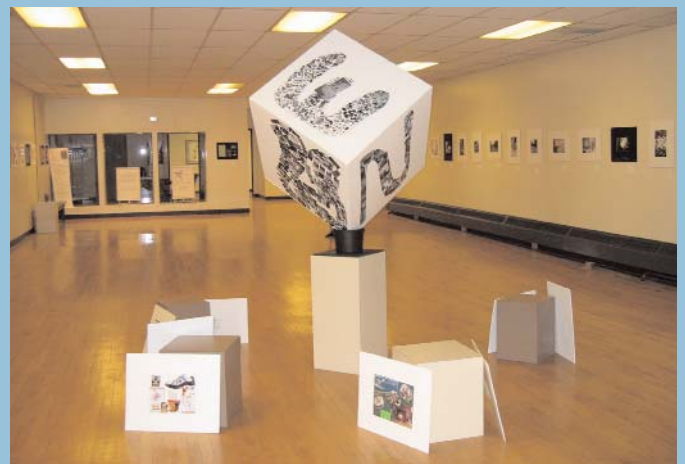
Mayer Studios displayed the works created during Project R.I.S.E.'s photo literacy program. The exhibit was titled "PhotoSynthesis: Me, Myself and Me as a Woman in the World."